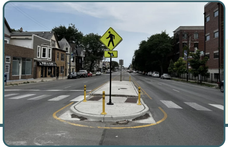
Installation of pedestrian island at Western/Winnemac through PB funding

In 2021, 40th ward residents voted to use menu funds to install a pedestrian island on Western/Winnemac to make way for safer and easier pedestrian crossings. 3